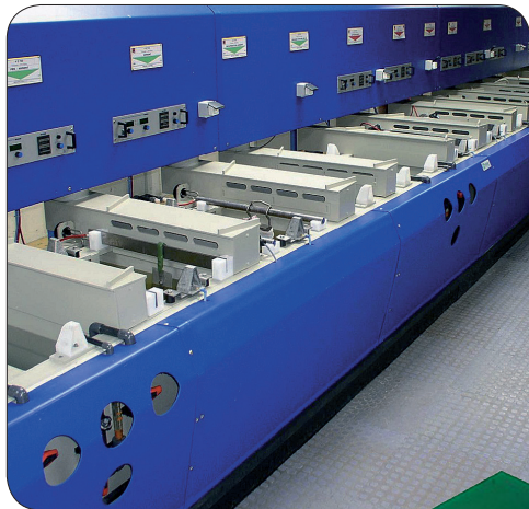
Manual plating production line